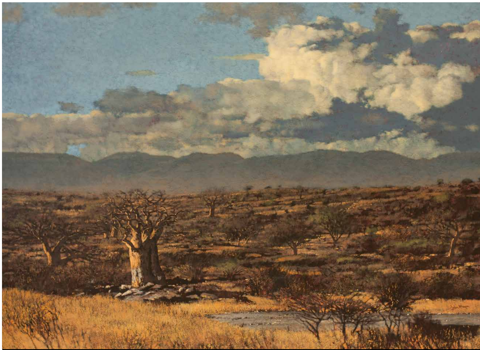
BORDERLINE 2013 mixed media on canvas 110 x 138 cm