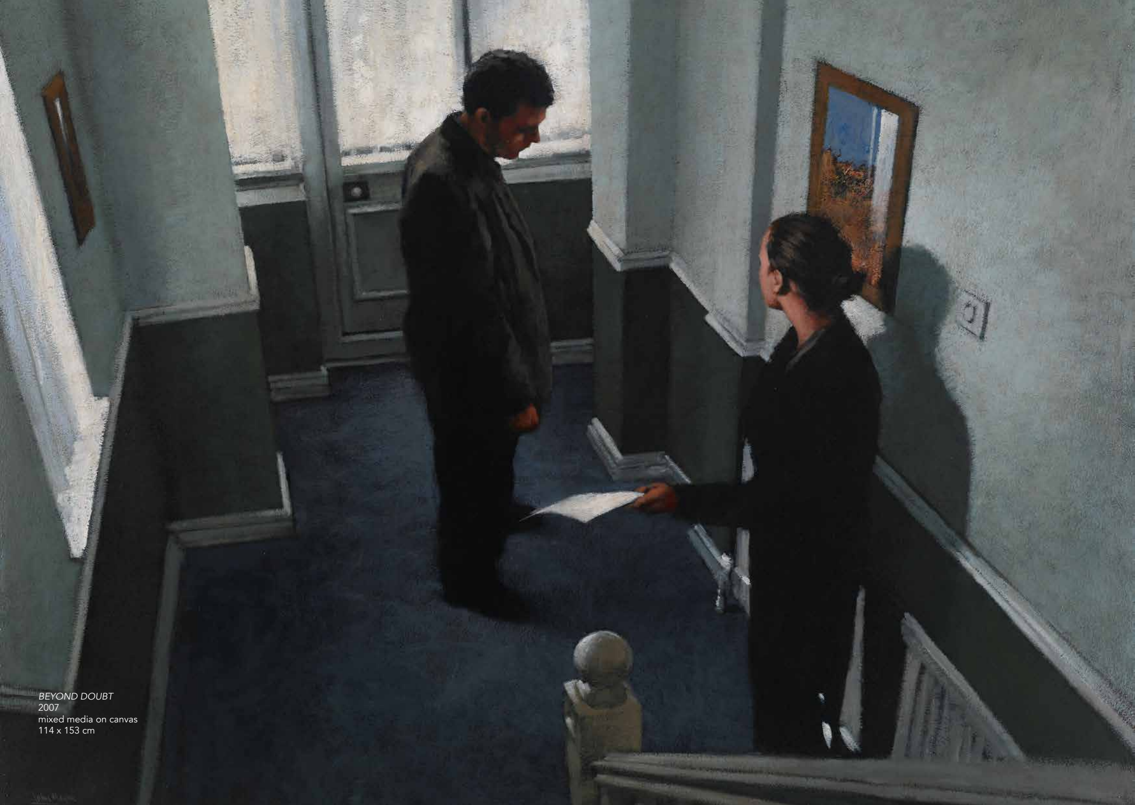
BEYOND DOUBT 2007 mixed media on canvas 114 x 153 cm