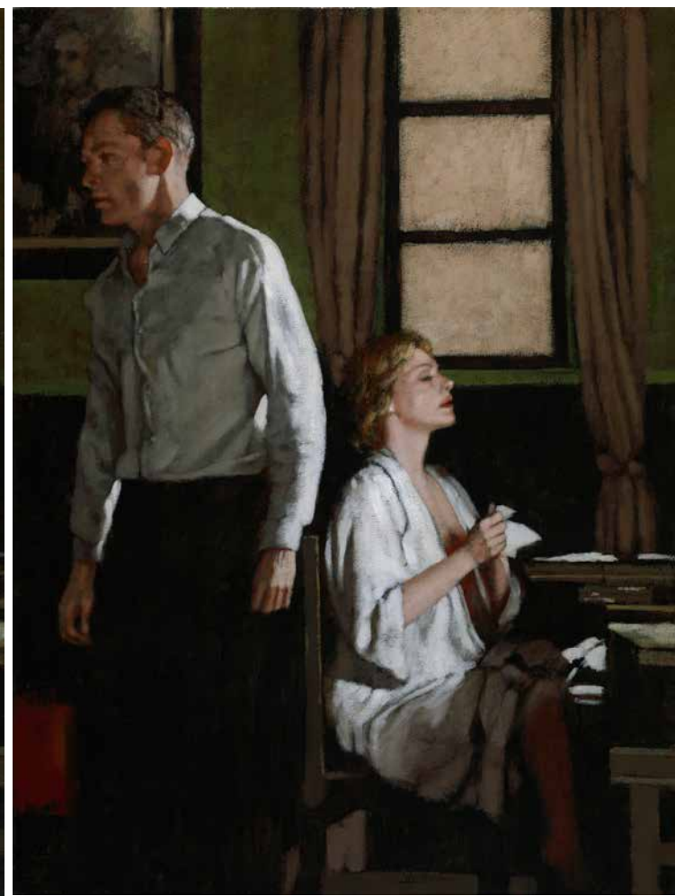
SLIPPING AWAY I II & III 2006 mixed media on canvas 102 x 76 cm each