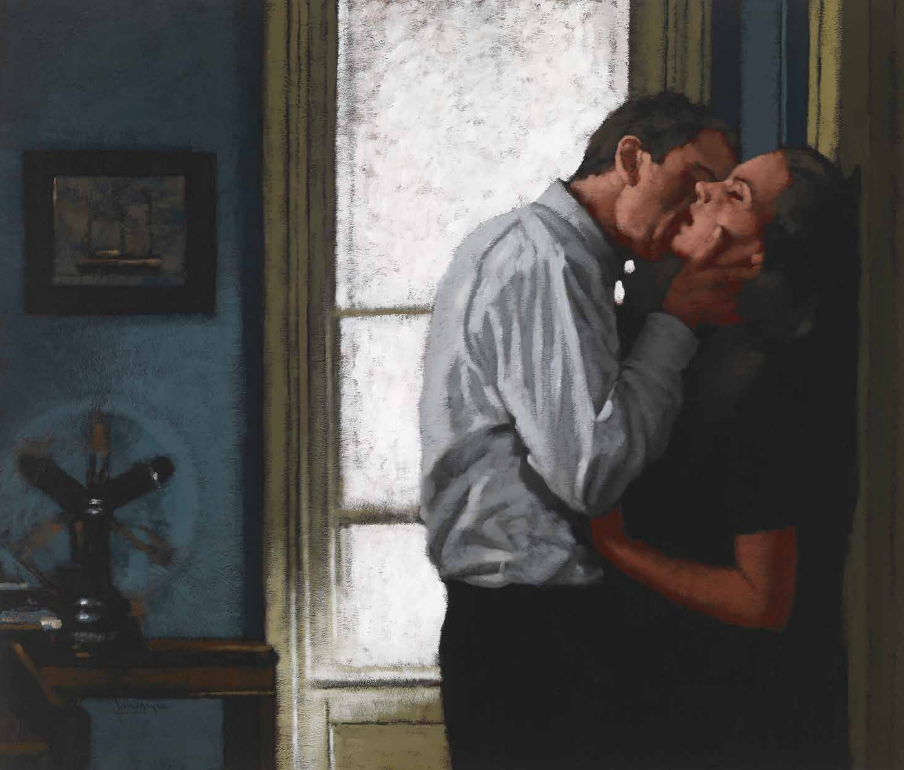
ALL THAT IT MEANT III (DETAIL) 2008 mixed media on canvas 76 x 92 x 3 cm each