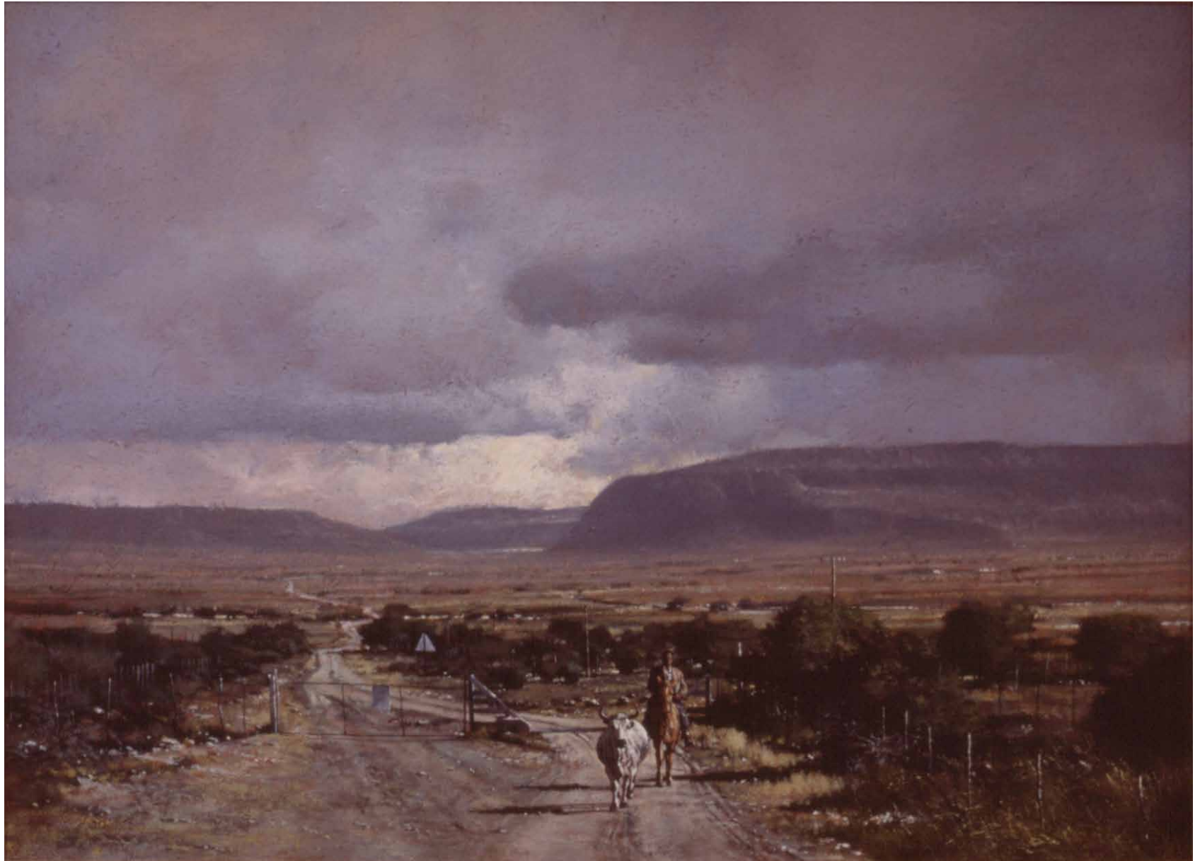
HEADING HOME - CAMDEBOO 1992 mixed media on canvas 80 x 110 cm