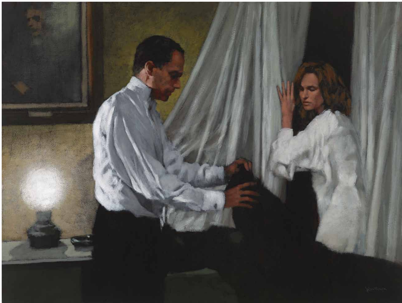
ALL I DIDN'T KNOW 2007 mixed media on canvas 92 x 122 cm