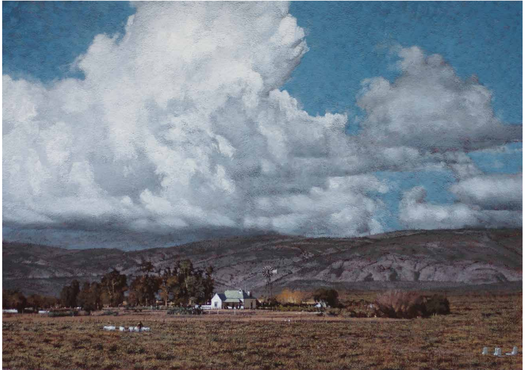
DIEPKLOOF 2014 mixed media on canvas 75 x 104 cm