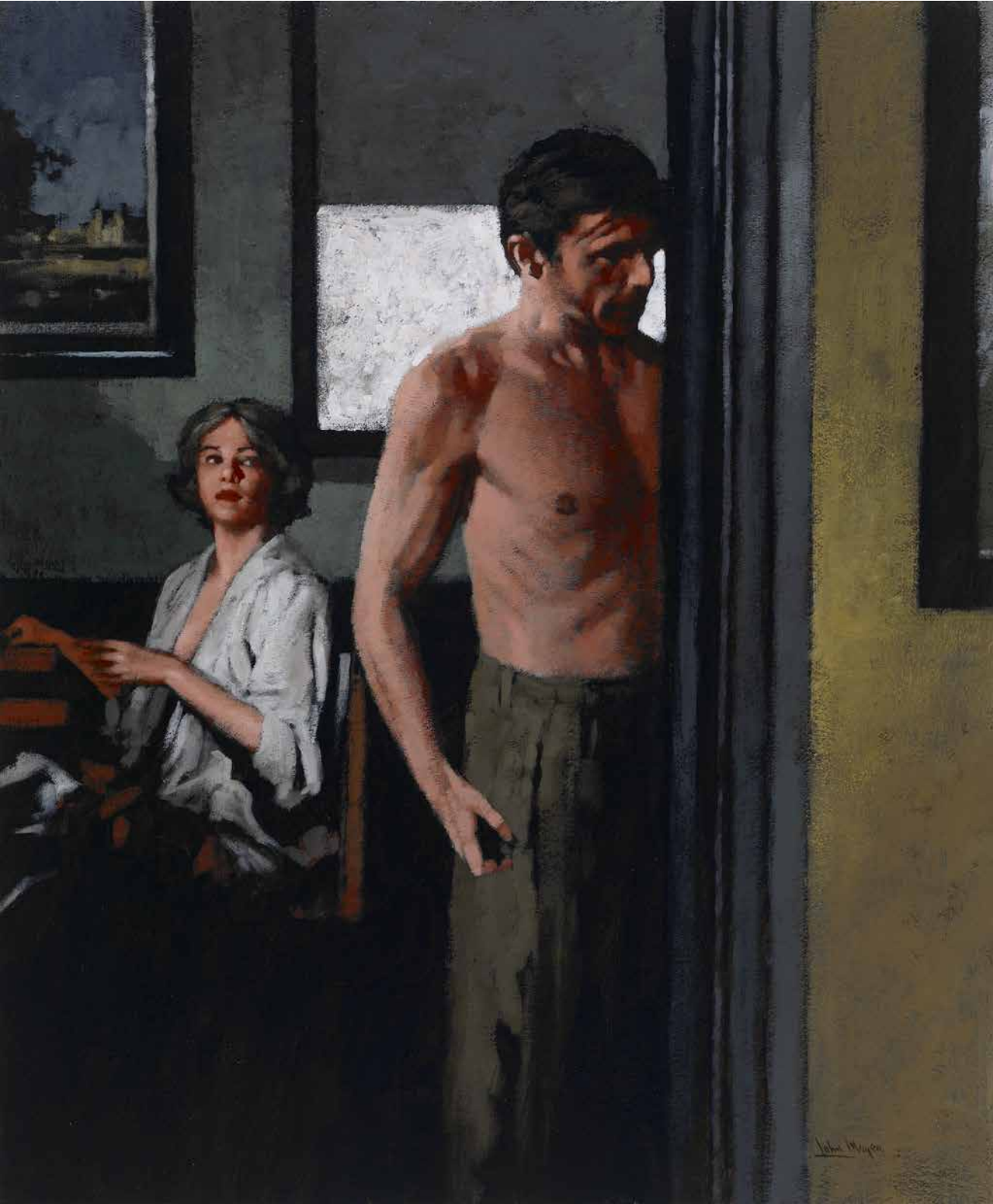
THE OTHER SIDE 2007 mixed media on canvas 92 x 76 cm