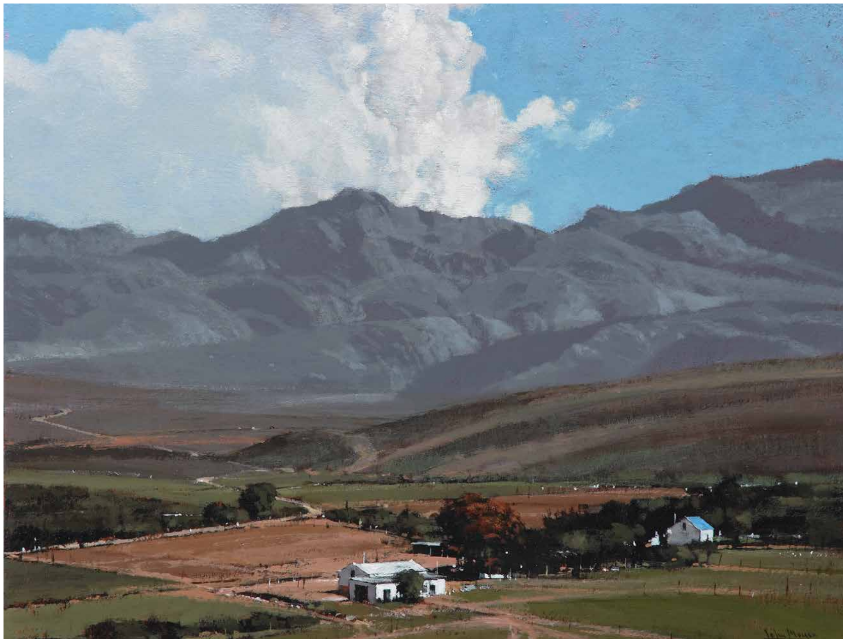
NEAR THE SWARTBERG PASS 2004 mixed media on canvas 48 x 59 cm