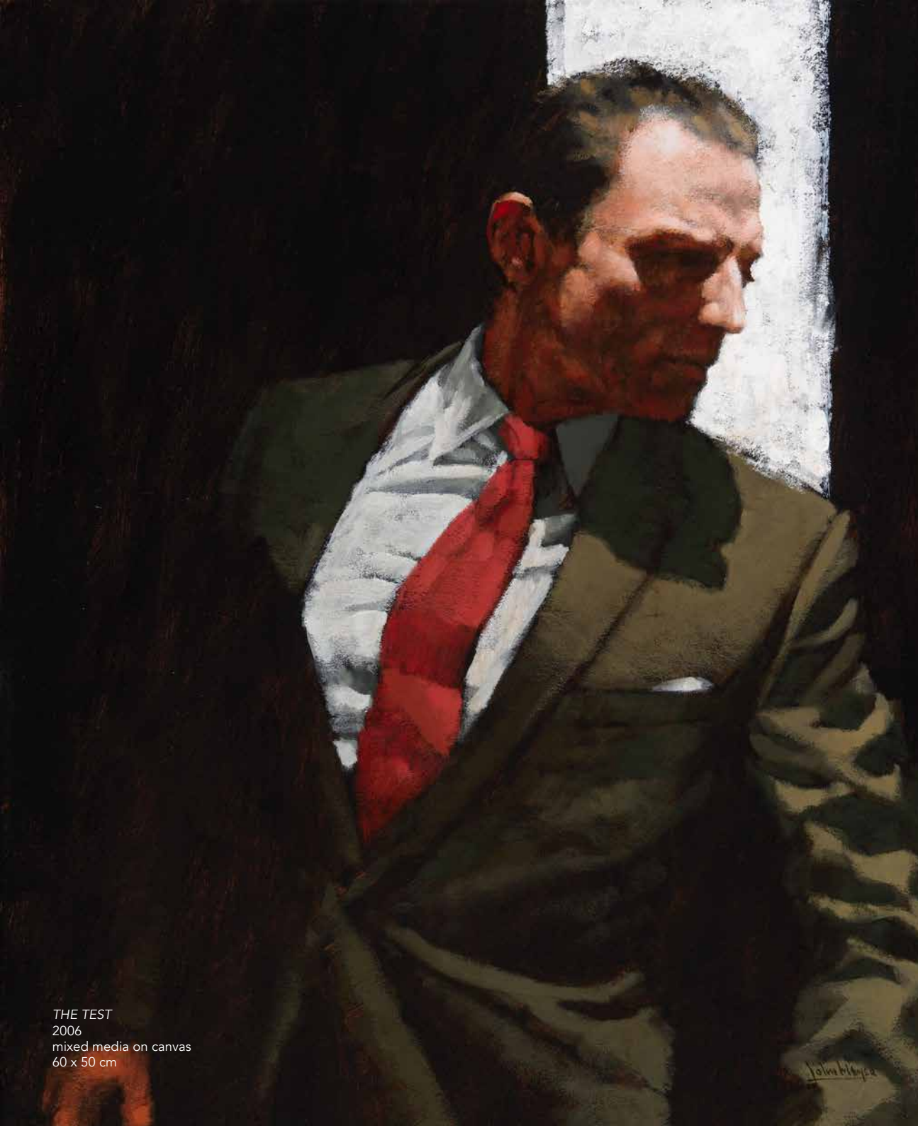
THE TEST 2006 mixed media on canvas 60 x 50 cm