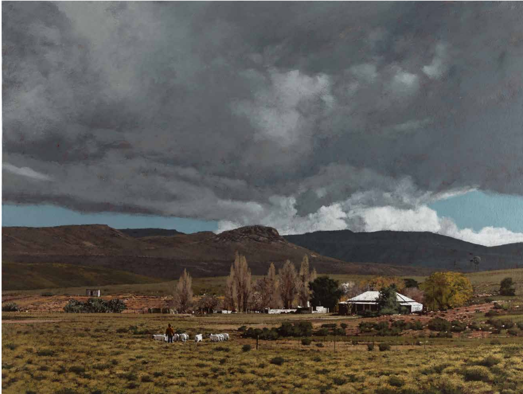
CG HULLE 2009 mixed media on canvas 114 x 153 cm