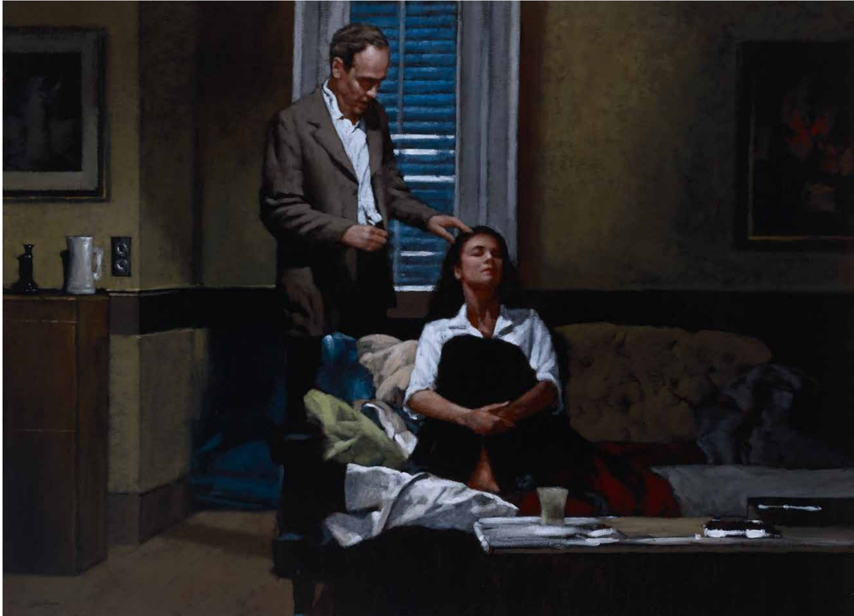
IF ONLY I HAD KNOWN 2008 mixed media on canvas 114 x 152 cm