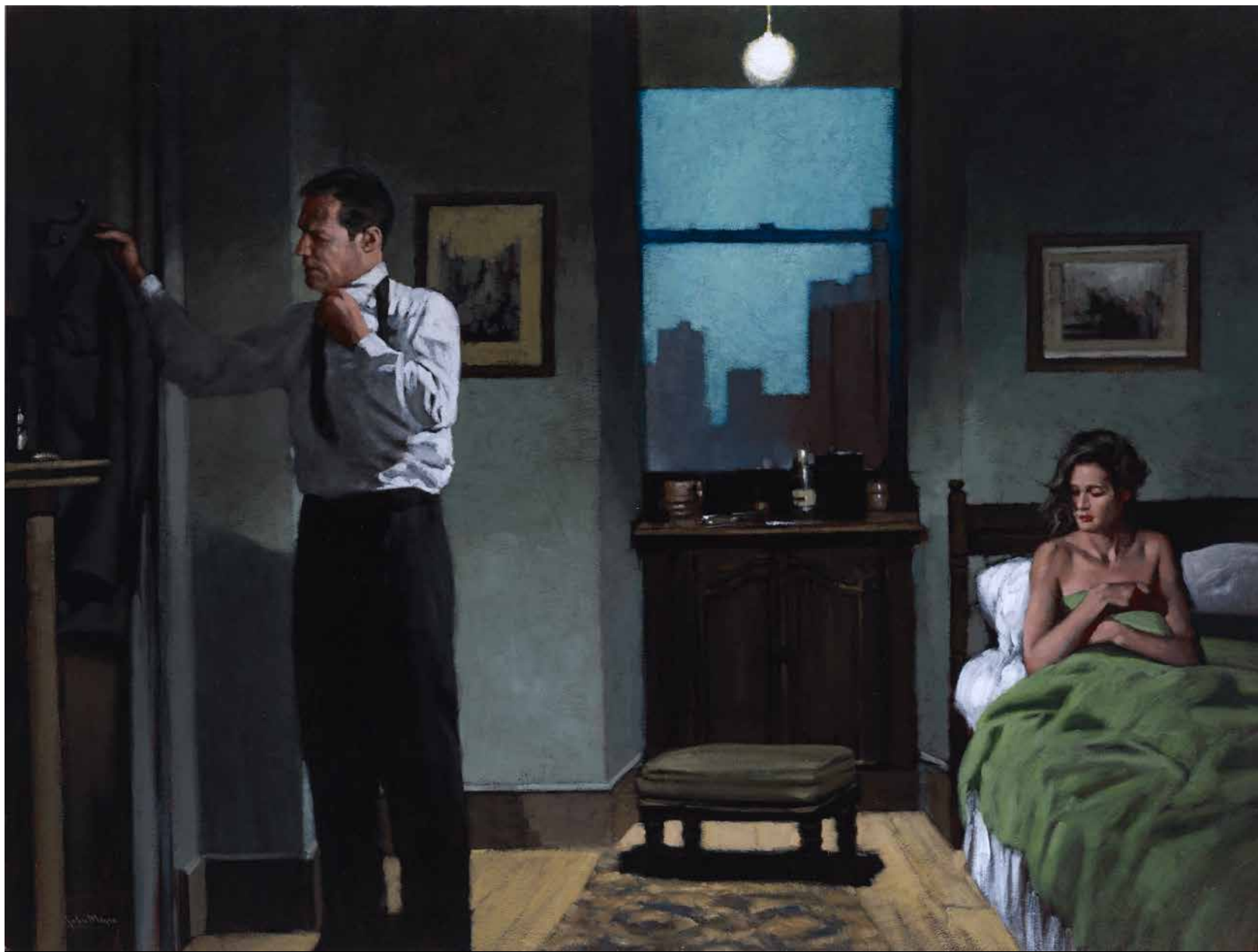
DREAMS OF THE CITY 2008 mixed media on canvas 113.5 x 151.5 cm