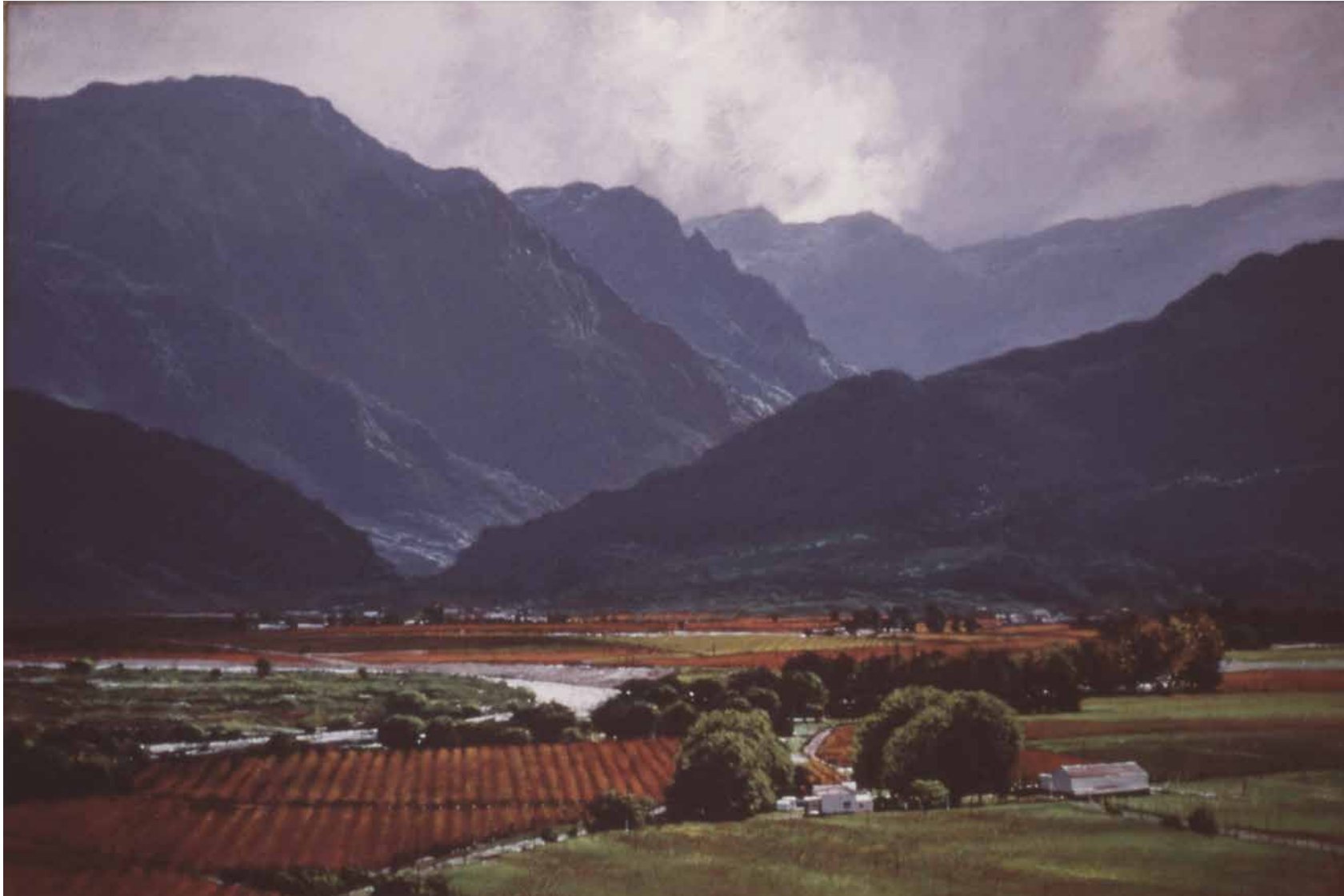
LATE AUTUMN, HEX RIVER 1994 mixed media on canvas 104 x 155 cm