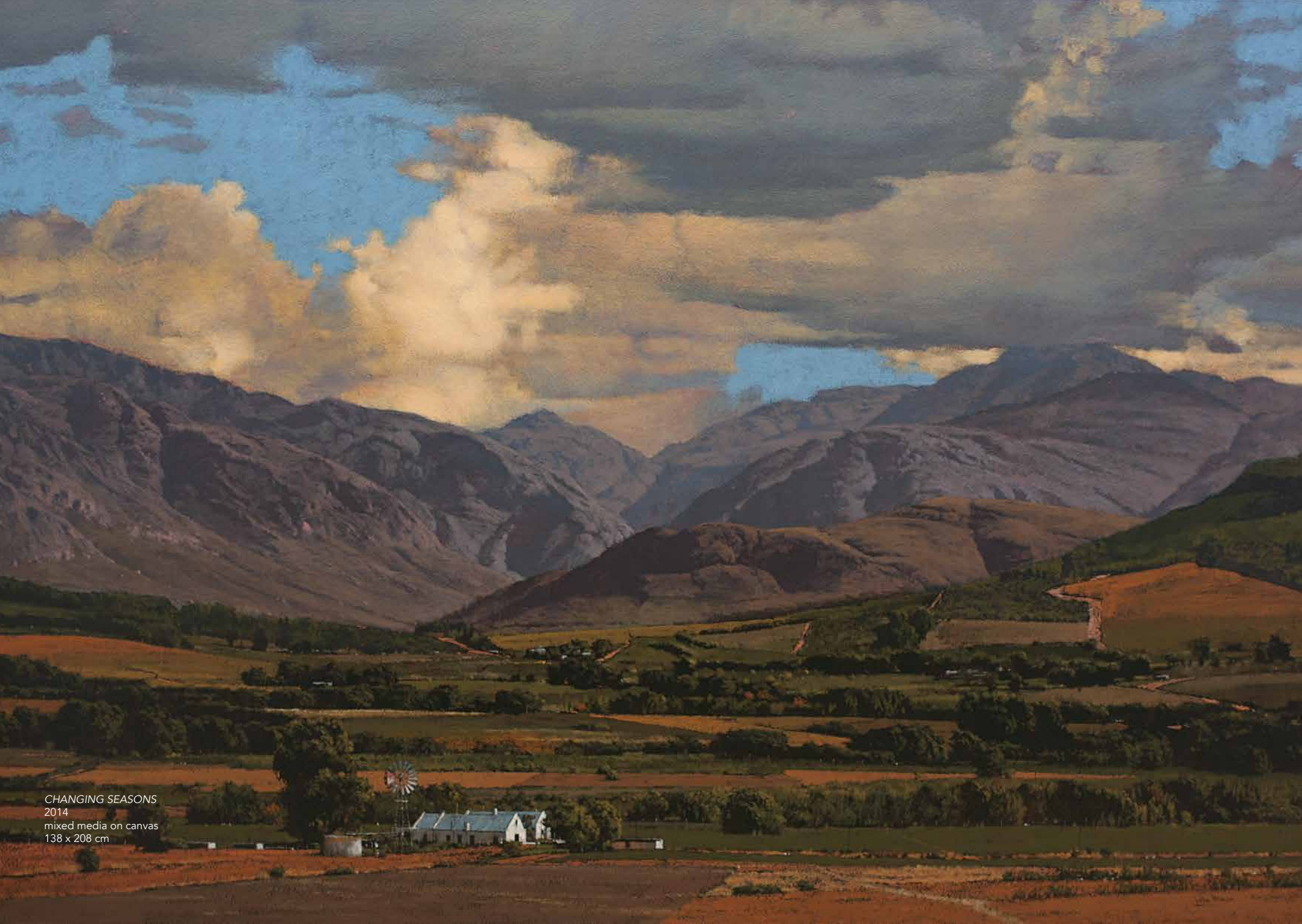
CHANGING SEASONS 2014 mixed media on canvas 138 x 208 cm