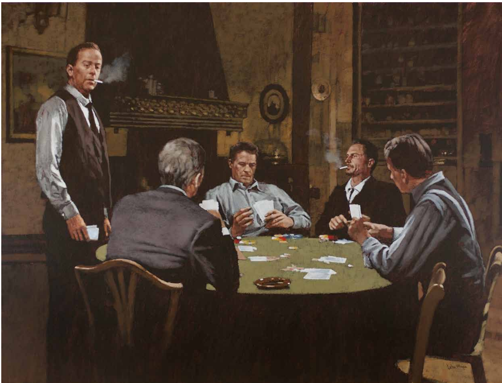
THE SITUATION 2017 mixed media on canvas 137 x 183 cm