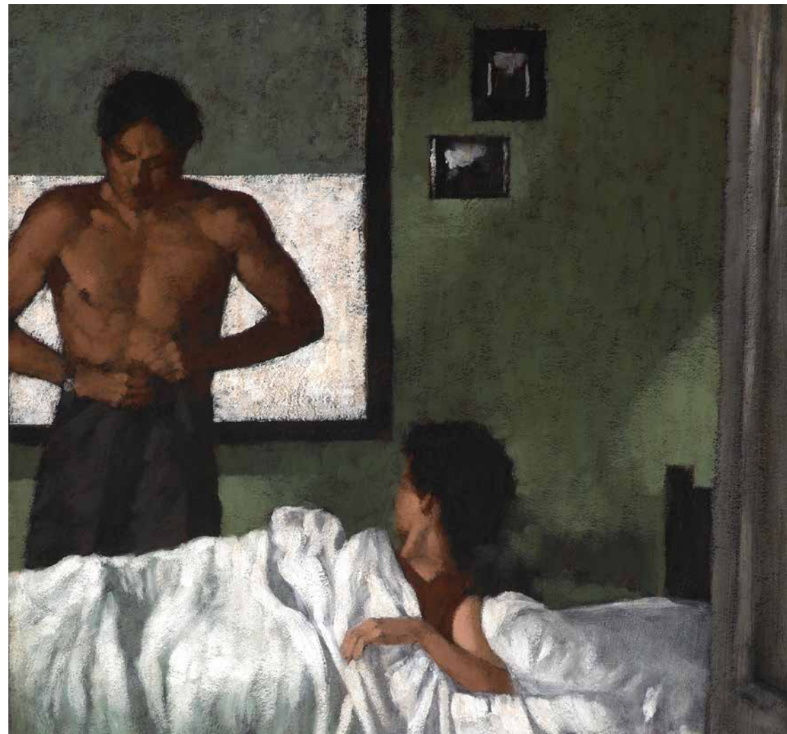
NIGHT MEMORIES I, II and III 2007 mixed media on canvas 76 x 92 cm each