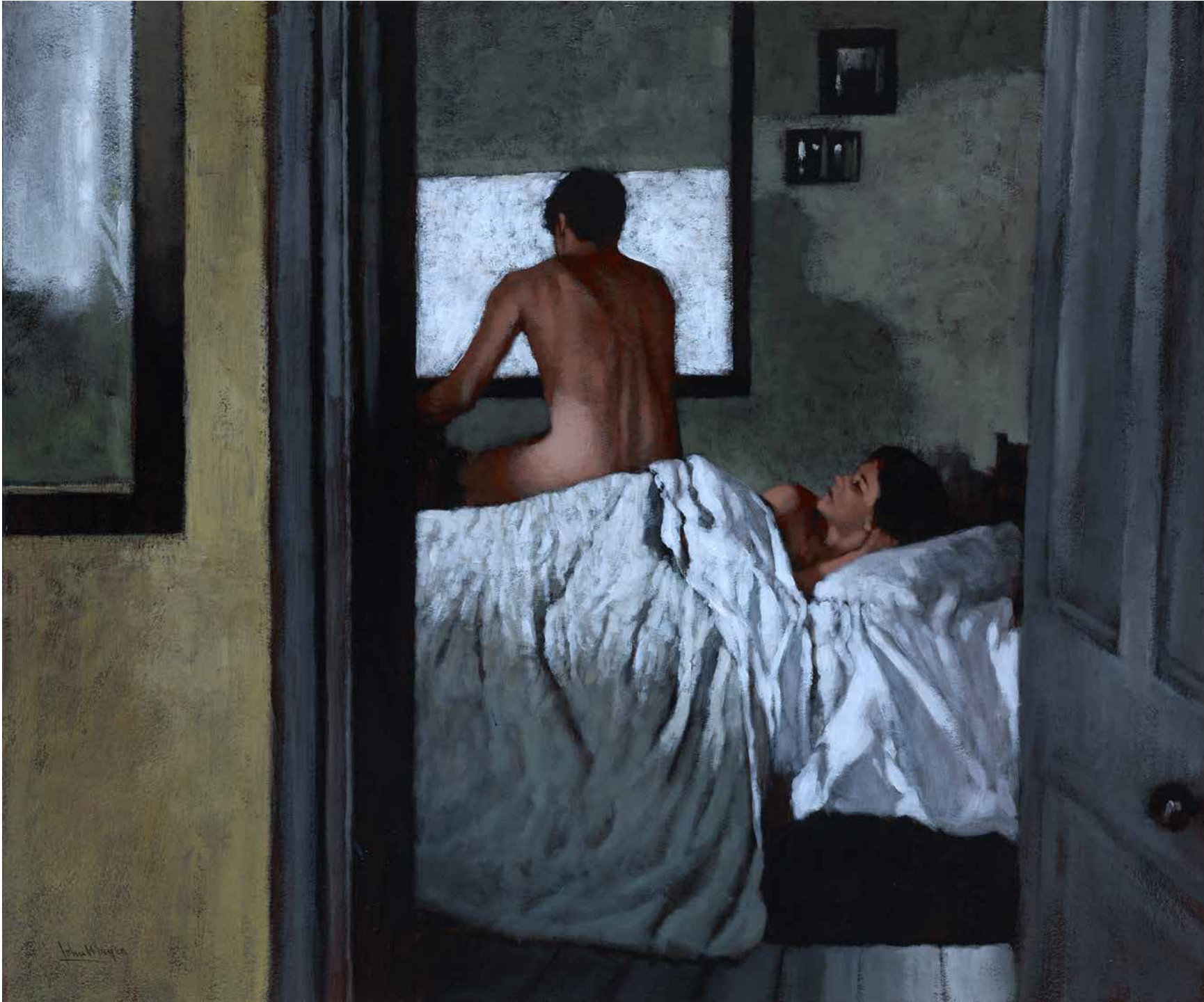
COME THE DAY 2008 mixed media on canvas 76 x 92 cm