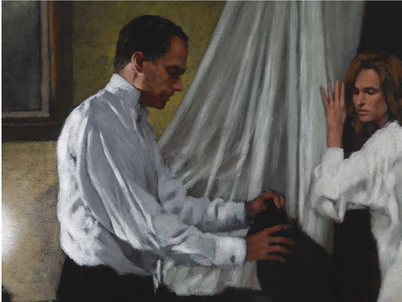
ALL I DIDN'T KNOW (DETAIL) 2007 mixed media on canvas 92 x 122 cm