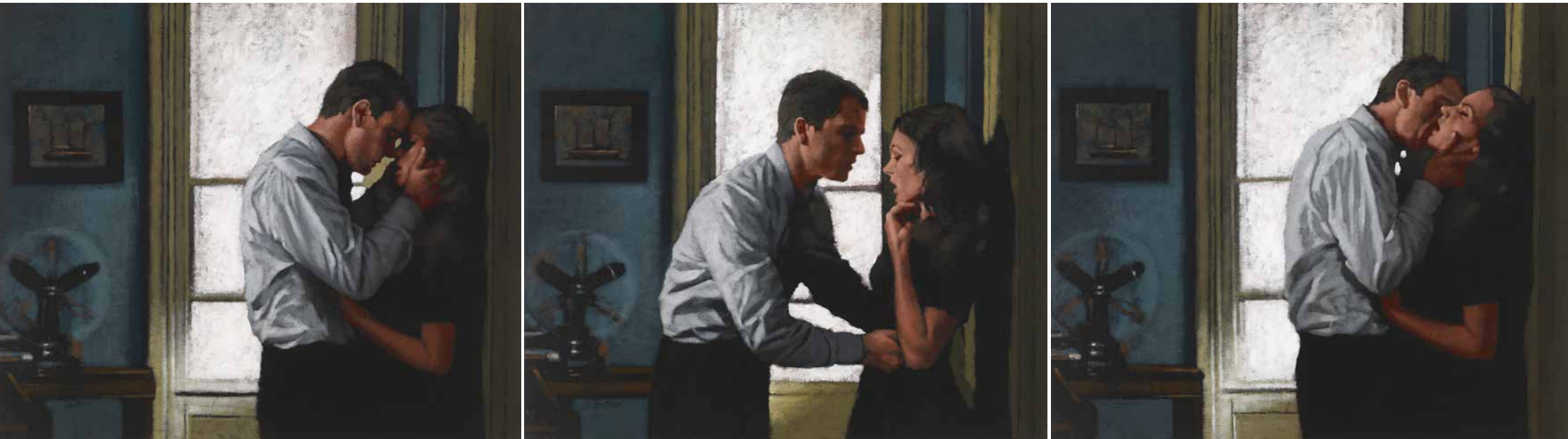
ALL THAT IT MEANT I, II & III 2008 mixed media on canvas 76 x 92 x 3 cm each