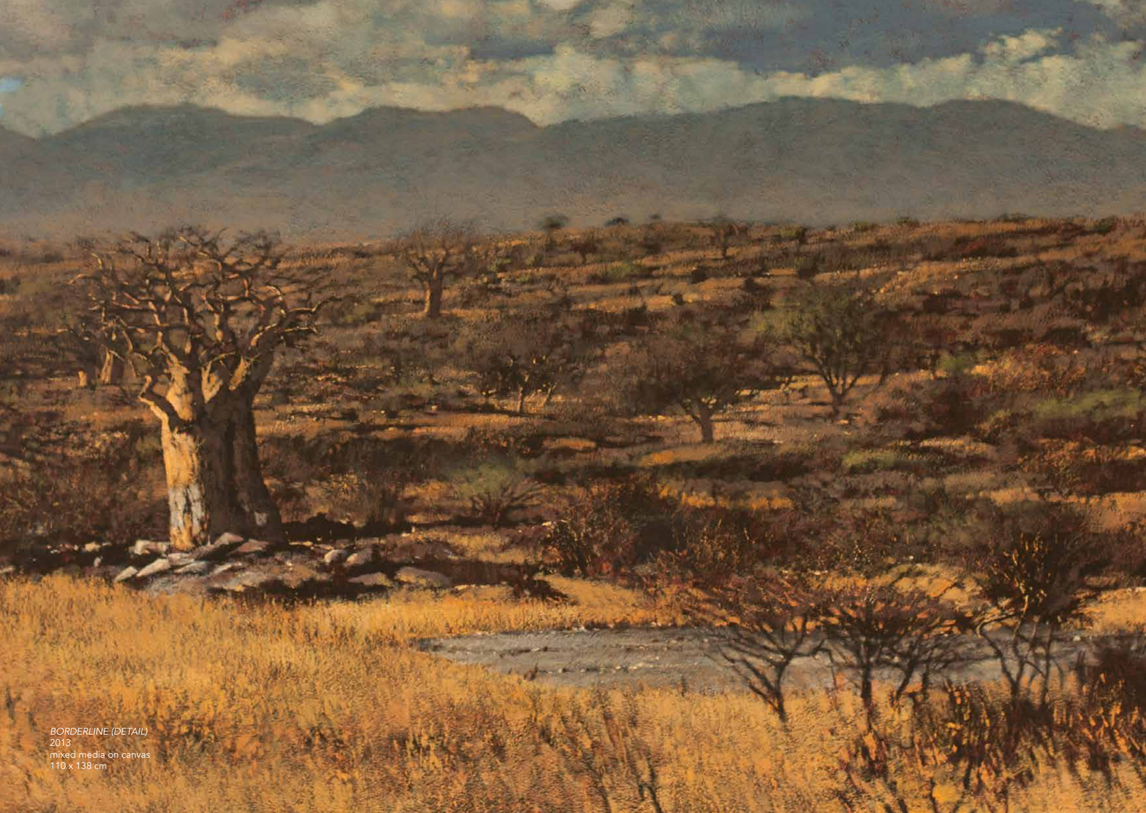
BORDERLINE (DETAIL) 2013 mixed media on canvas 110 x 138 cm