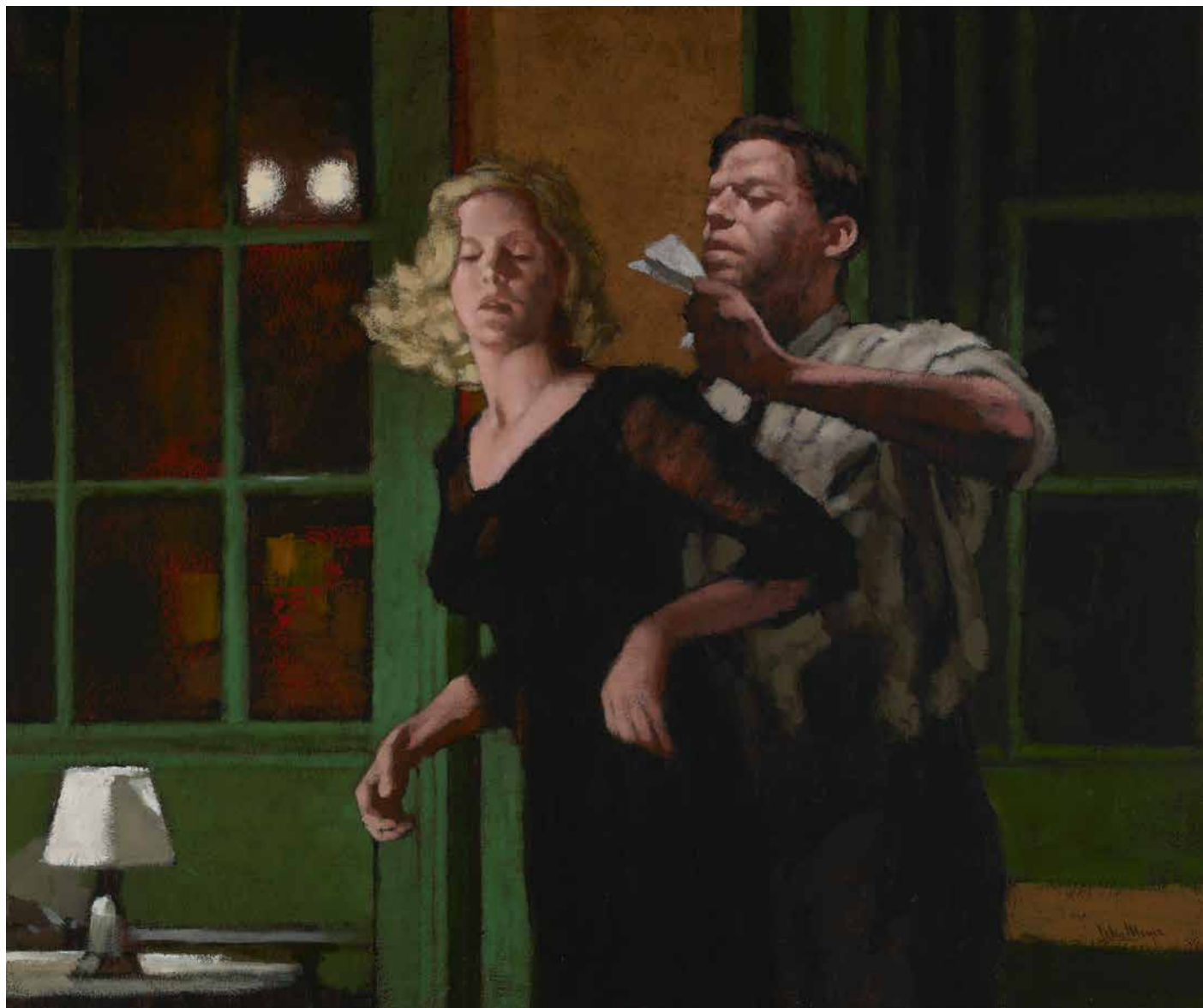
THE SAME OLD REASON 2007 mixed media on canvas 76 x 92 cm